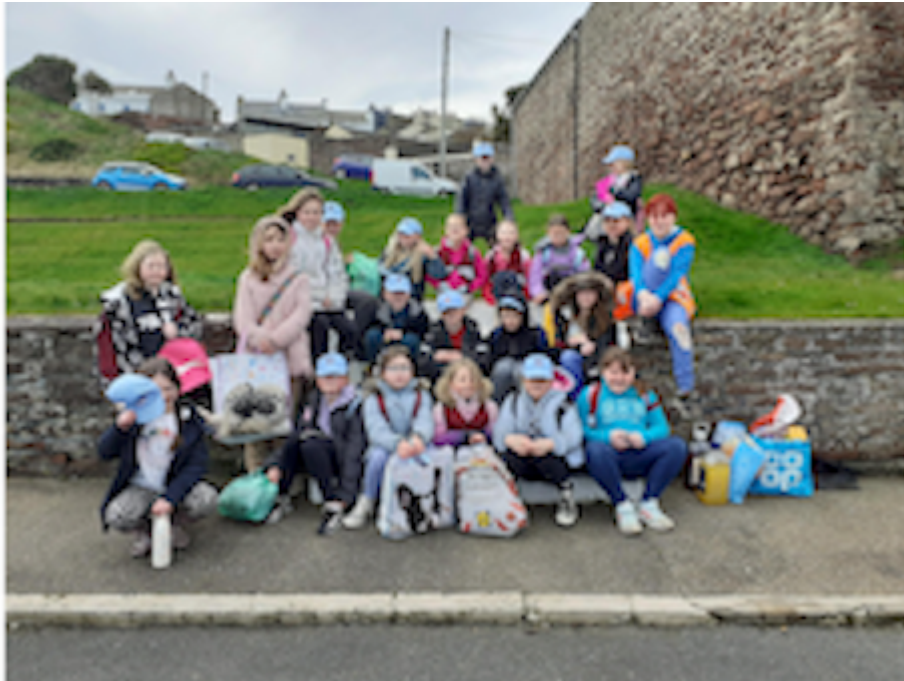
Waiting to go on adventures at Silverdale