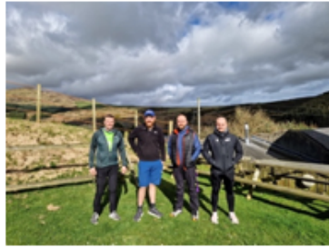
DofE expedition training