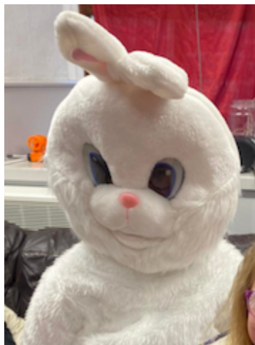
Cotton Tail Rabbit starred at Peel's 'Down the Rabbit Hole' event