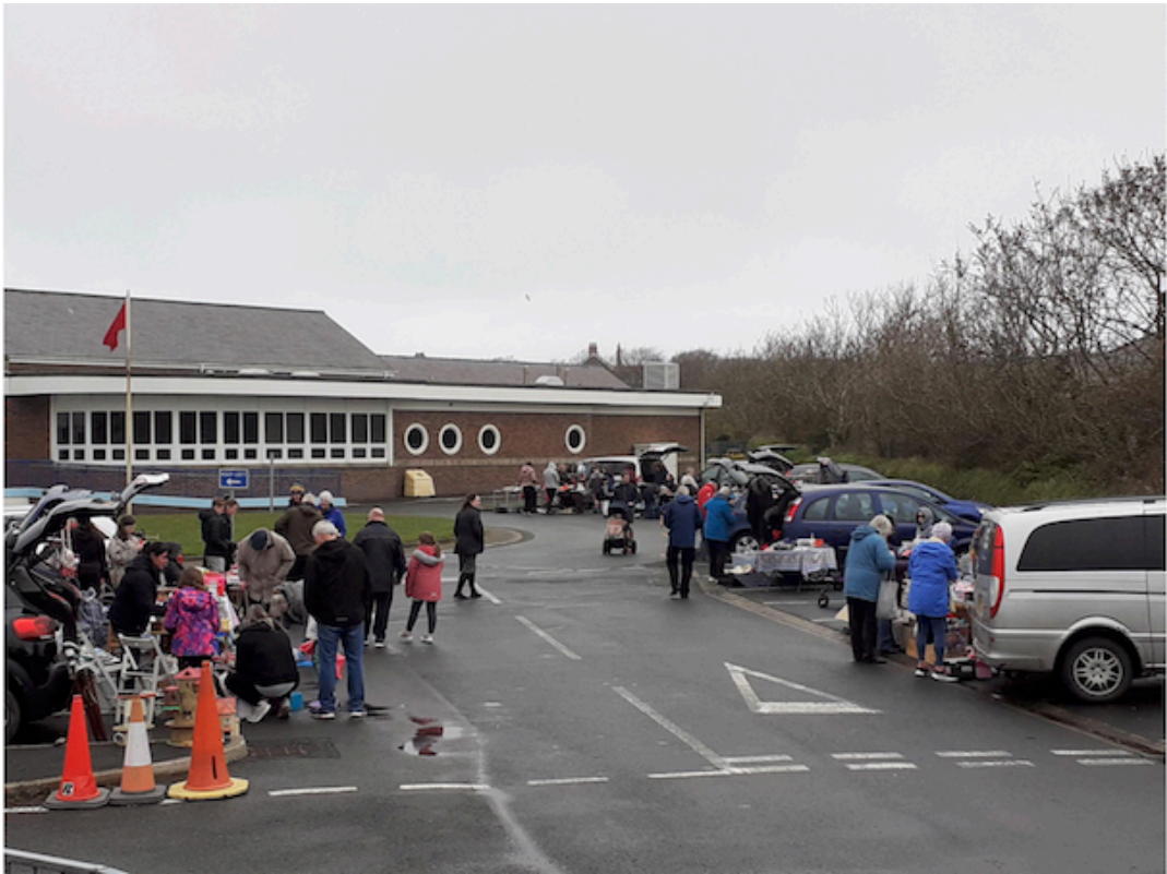
Peel Youth Club - Car Boot Sale