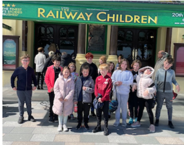
A group from St. Johns Youth Club went to watch a fellow member performing in The Railway Children.