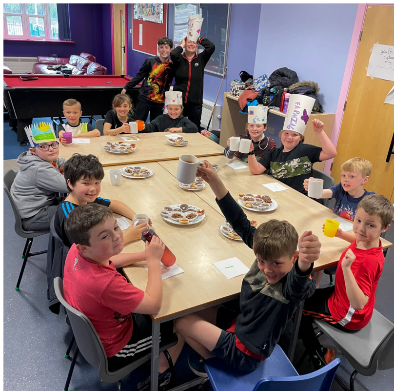
St. Johns members prepared food and made hats for a Mad Hatters Tea Party during the Easter Holiday Club.