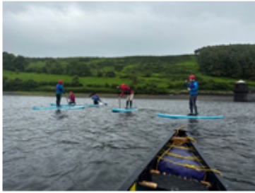
UCM taster session