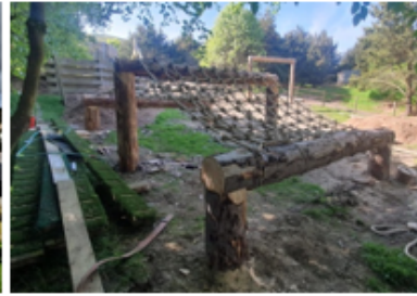
Assault course progress